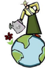
Northeast Wisconsin Unit of the Herb Society of America

The Northeast Wisconsin Unit of the Herb Society of America is a group of herb enthusiasts who started as an herb study group. In 2002, they requested and received affiliation with the Herb Society of America.