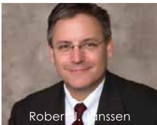
Robert J. Hanssen