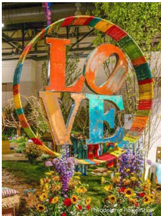
Philadelphia Flower Show

Planters for annuals throughout the Garden | $700 each