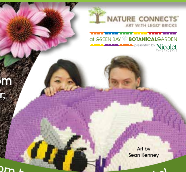
Art by Sean Kenney

NATURE CONNECTS ART WITH LEGO® BRICKS at GREEN BAY BOTANICAL GARDEN presented by Nicolet NATIONAL PARK