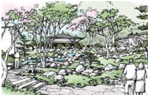
Asian Garden Schematic Design