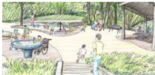
Nielsen Children's Garden Expansion Schematic Design